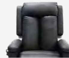
Easily adjustable to Kyphosis configuration