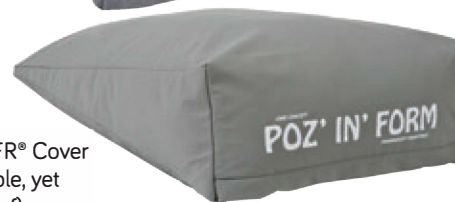
• Lenzing FR® Cover (Breathable, yet waterproof)