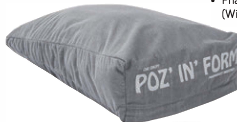
• Pharmatex Cover (Wipe-down)