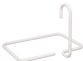
Bed Pole With Adjustable Crook Handle BEA014150