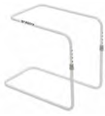
Adjustable Height Bed Cradle BEA014610