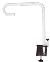
Clamp On Bed Pole BEA009300 & BEA009310