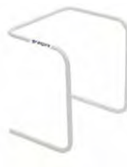
Fixed Height Bed Cradle BEA014605