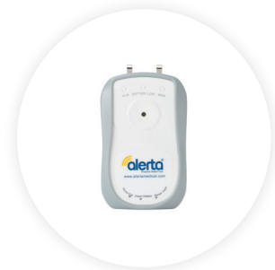
Alarm Monitor - Wired