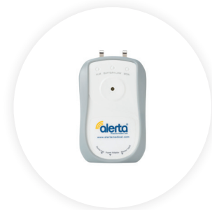
Alarm Monitor - Wired