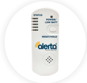
Alarm Monitor - Wireless