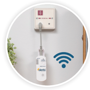
Wireless Option Available

Plush carpet floor mat that provides a safe falls prevention solution that suits modern care environments