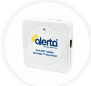
Alerta Wireless Transmitter

Soft padded mat helps to minimize serious injury in the event of a fall from bed