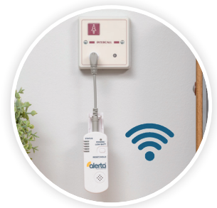
Wireless option available

Alerts carers if patient leaves or attempts to leave chair, helping to manage falls risk