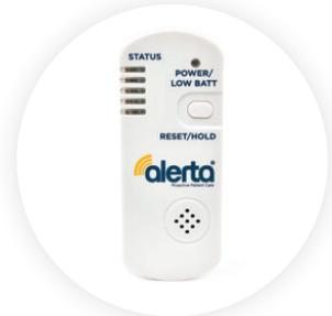
Alarm Monitor - Wireless