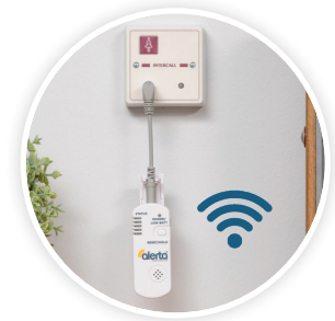
Wireless option available

Provides advanced warning of falls risk if patient leaves or attempts to leave bed