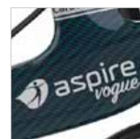
Signature Carbon Fibre Weave