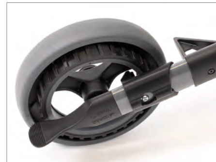
The edge guard and the Reverse Braking System (RBS) make everyday life easier. Permanently braked; pull to walk/release to stop.