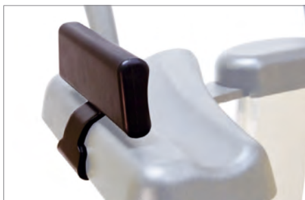
Forearm side support (pair)