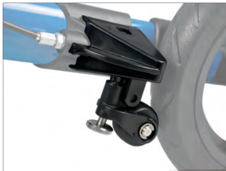
Roll Resistance System (RRS) installed beneath the edge guard.

This is fitted above or below the edge deflector on the wheel and is seamless adjustable using the small dial. This enables the rollator's resistance to be individually adapted to the needs of the user – so that the user always has the optimum resistance to be able to walk safely and evenly.