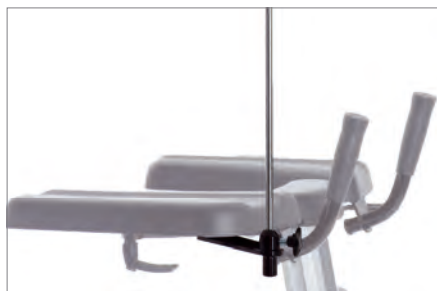
Stand for body fluid-boxes