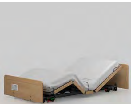
Low position, back and knee raised Sublime Teak side panels (accessory)