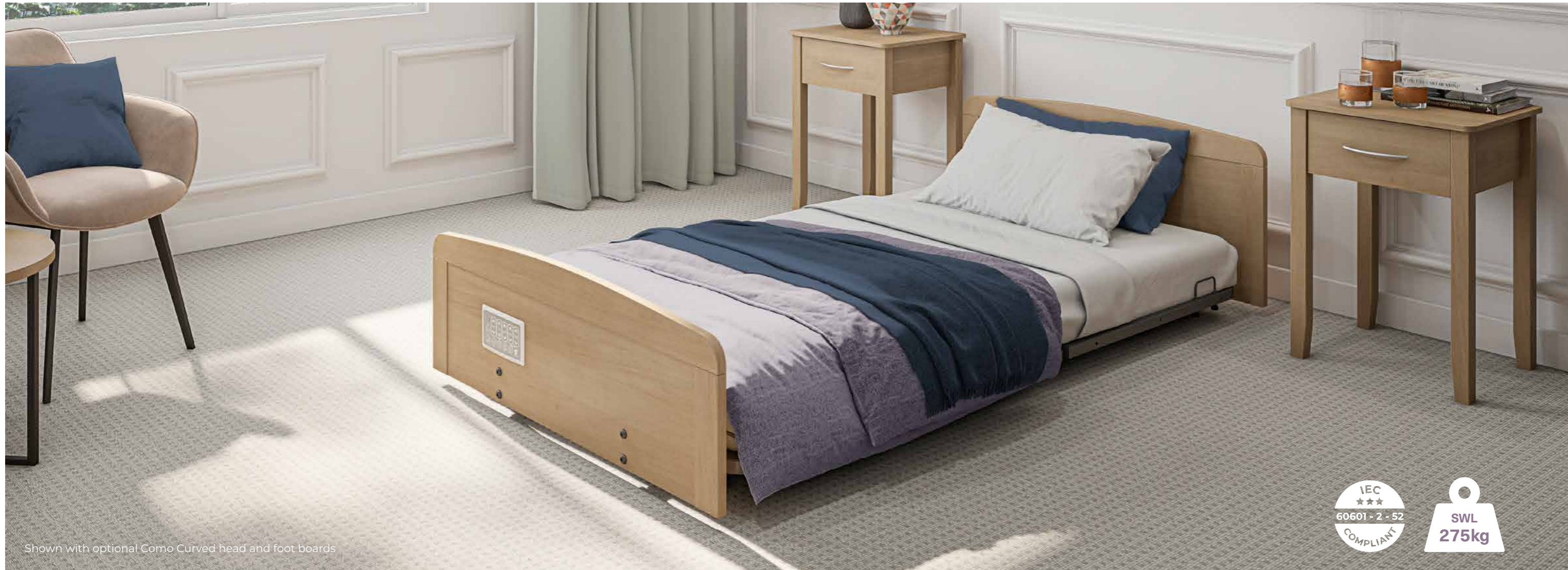
Shown with optional Como Curved head and foot boards