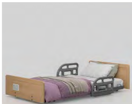
Floorline position Split folding grab rails (accessory)