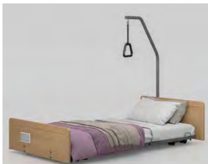
Floorline position Self help pole (accessory)