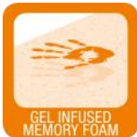
GEL INFUSED MEMORY FOAM