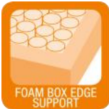
FOAM BOX EDGE SUPPORT