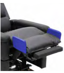
Channel Legrest CHP198320