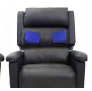
Lateral Support Blocks CHP198315