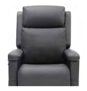
Backrest CHP198290 - Medium CHP198291 - Large