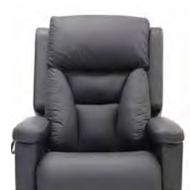
Backrest CHP198295 - Medium CHP198310 - Medium CHP198296 - Large