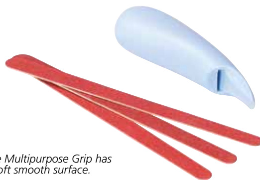
The Multipurpose Grip has a soft smooth surface.

Beauty Multipurpose grip rests securely in the whole hand and offers a variety of use. With a poor hand function it can be very difficult to use a nail file. By inserting a nail file into the narrow end, a pedicure can be done with ease. The wider end of the grip may be used for a tooth brush or shaver.