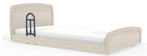
Bed Lever BA7842