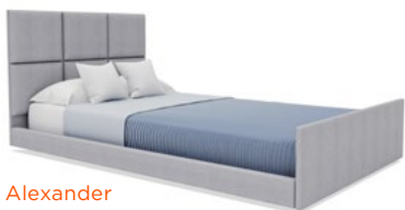
Alexander Fabric in Dove