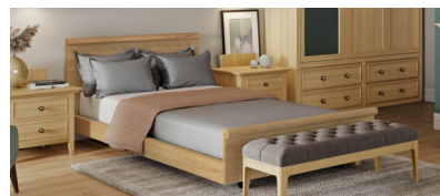
Salisbury Elm Lissa Oak