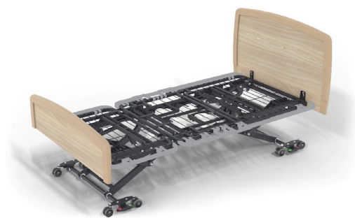
1050mm WIDTH ADJUSTMENT