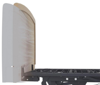
BUILT-IN LENGTH EXTENSION