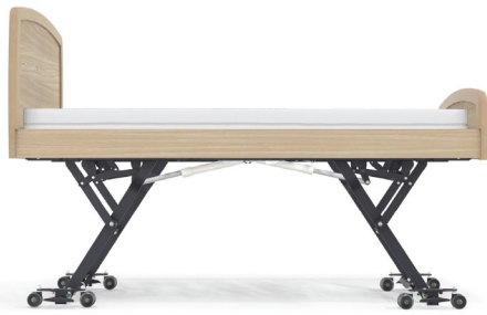
FULL NURSING HEIGHT 800mm