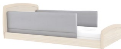
Folding side rails with bumpers BA7852 Single folding rail (set x2) BA7851 King single folding rail (set x2) BA7853