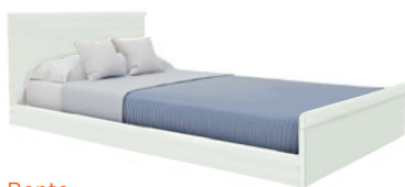
Bento Laminate in White