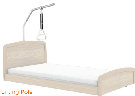
Lifting Pole BA7830