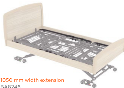
1050 mm width extension BA8246 Length extension BA0964