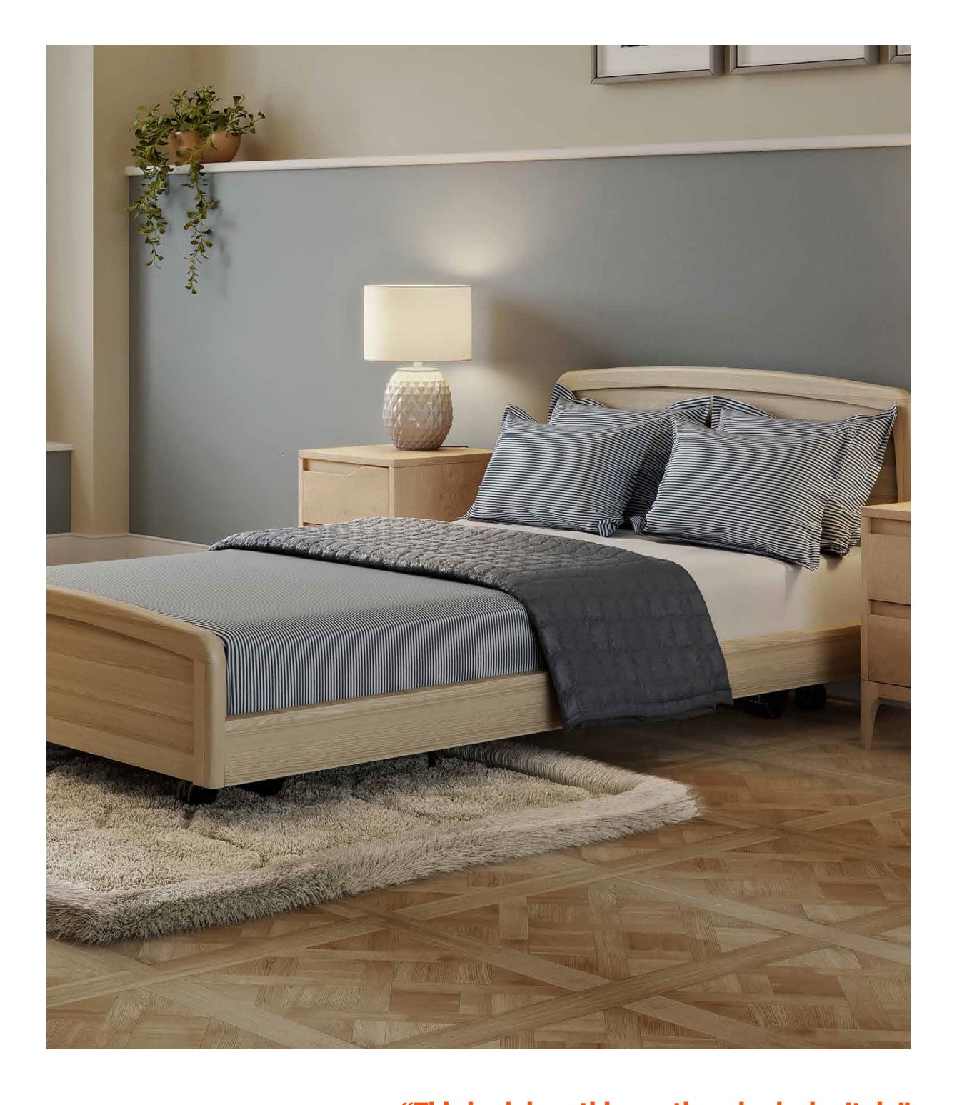
"This bed does things others beds don't do"