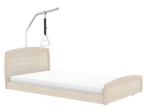
LIFTING POLE BA7830