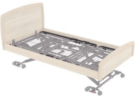
LENGTH EXTENSION BA0964