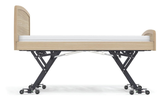
FULL NURSING HEIGHT

Full height adjustment for caregiver safety and aiding the delivery of high quality care to residents.