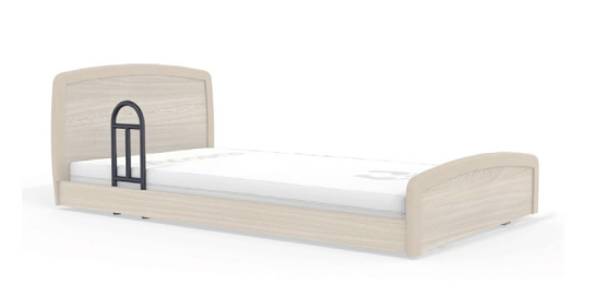
BED LEVER BA7842