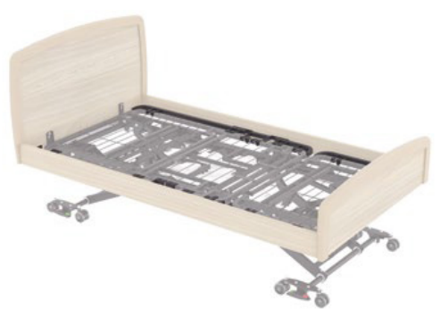
1050 MM WIDTH EXTENSION BA8246