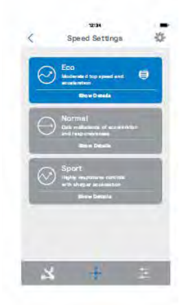
Set the drive mode to "Eco", "Normal", or "Sport" depending on your needs.