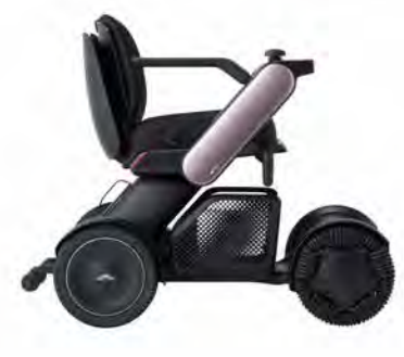
Pink LEFT/WCA870560 | RIGHT/WCA870570