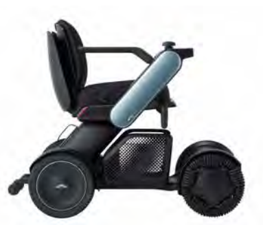
Light Blue LEFT / WCA870520 | RIGHT / WCA870530