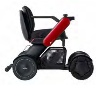
Red LEFT/WCA870600 | RIGHT/WCA870610