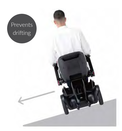
Drive straight on a tilted path.