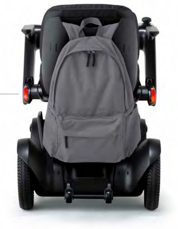
The tail light is clearly visible even with a bag hung over the back support, keeping you safe on the road at night.