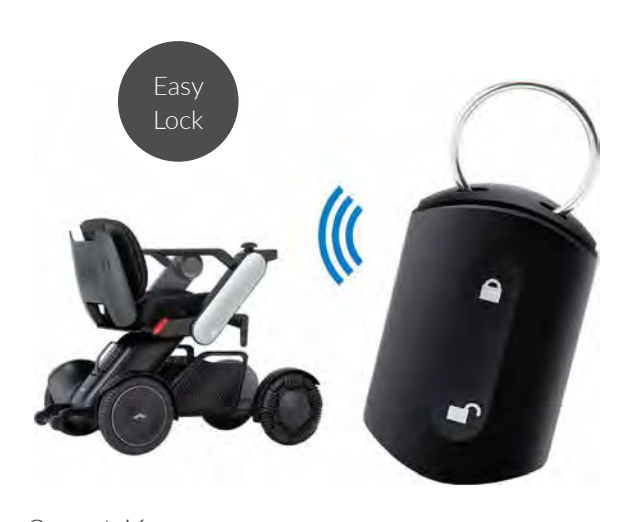
Smart Key Remotely lock the device.