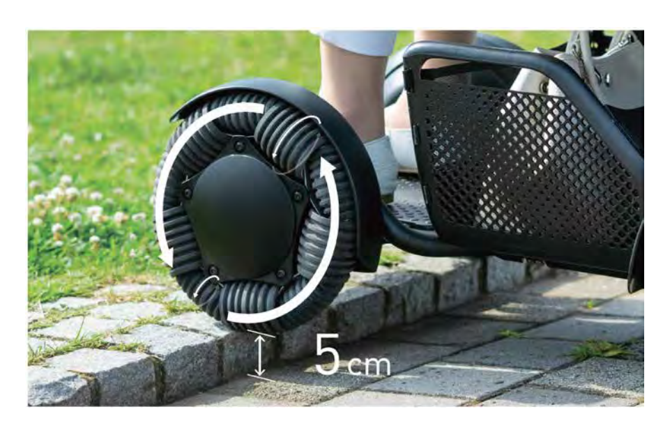
Effortlessly climb over obstacles up to 5cm in height with two powerful motors and large front omni-wheels.