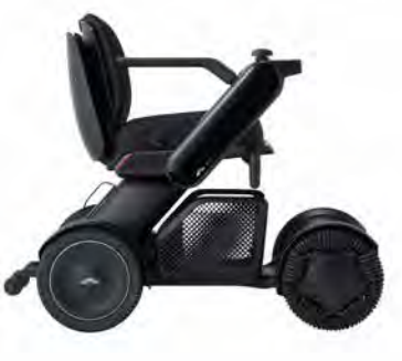
Black (supplied standard) LEFT / WCA870460 | RIGHT / WCA870470