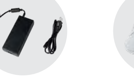
Battery Charger WCA870410

*It is not waterproof. Do not use for protection from rain.