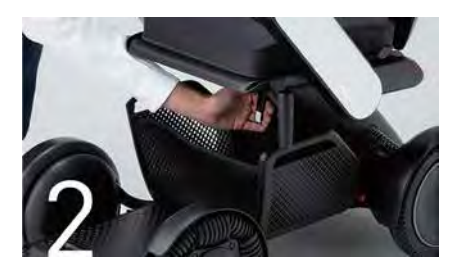
Raise the lever under the seat.