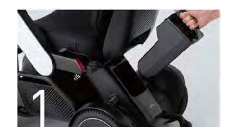
Remove the battery.

The Model C2 can be disassembled for easy transportation in the boot of any car. Whether you're shopping on the weekend or traveling with your family, the Model C2 allows you to live life to the fullest.