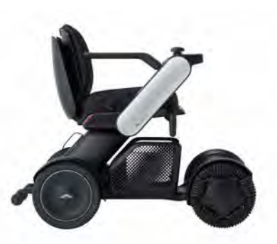
White LEFT / WCA870580 | RIGHT / WCA870590