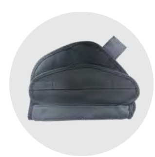
Side Storage Bag wca870430