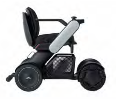
Grey LEFT / WCA870500 | RIGHT / WCA870510