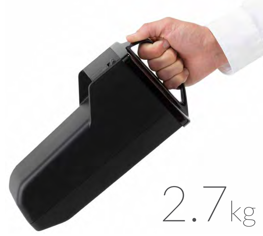
The battery can be removed and charged in a regular household outlet.

Model C2 can travel 18km on a 5-hour charge, giving you ample power to go about your day.