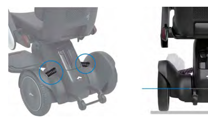
Rear wheel suspension absorbs the impact when driving over bumpy roads or obstacles.