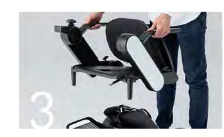
Pull the seat upwards.