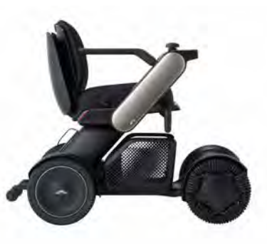
Gold LEFT/WCA870480 | RIGHT/WCA870490