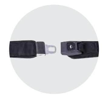
Lap Belt wca870420

Firmly stabilises the sitting position even on slopes. Note: Standard inclusion