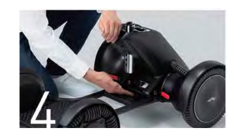
Pull the lever on the side of the battery towards you to separate the parts.