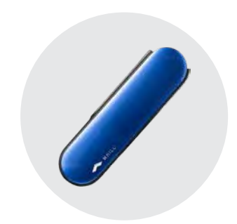
Arm Covers SEE PAGE 10-11 FOR CODES

Purchase accessories for even more convenience and personalisation.