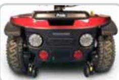
Full Lighting Package

The Pathrider® 130 XL incorporates a blend of power, style and performance to handle rugged outdoor terrain. The powerful drivetrain, 24 Volt, 4-pole motor for increased power, 11.4 cm (4.5") ground clearance and maximum speed of 10 km/h (6.2 mph) combine power and torque to accelerate your active lifestyle. Standard features include feather touch disassembly, wraparound delta tiller, 33 cm (13") pneumatic tyres, front and rear suspension, high-back reclining seat, full lighting package, infinitely-adjustable tiller, front basket and rearview mirror. Available in Red and Silver.