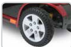
33 cm (13") Pneumatic Tyres