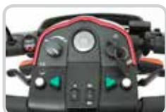
Easy Drive Tiller