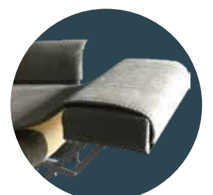
Thicker/ softer footrest