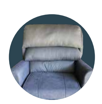
Waterfall back for gluteal shelf