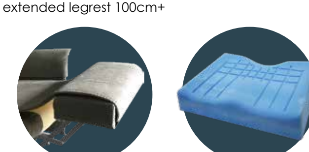
Pressure Care Roho, equagel, flexigel